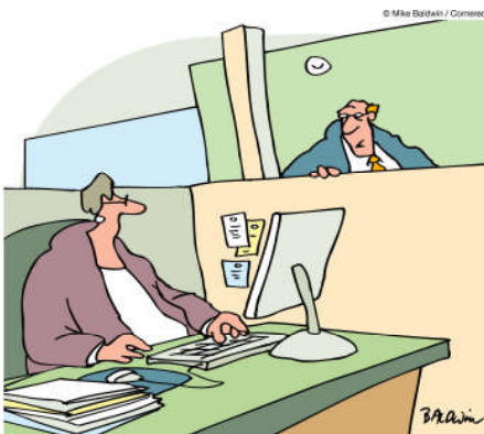
“The article you sent me on how technology causes stress crashed my computer.”