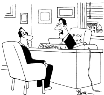
“Sorry, we just filled our ‘Financial Analyst’ position, but we do have an opening in ‘Sacrificial Lambs.’”

Are Digital Devices Dumbing Us Down?.....Page 4