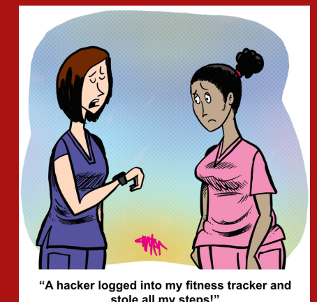
stole all my steps!"